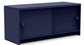
navy blue: SG-SC40-NB