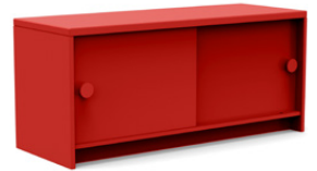
apple red: SG-SC40-AR