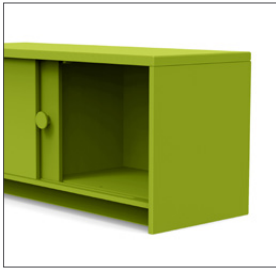
Dual sliding doors with center divide.