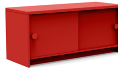
apple red: SG-SC40-AR