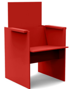
apple red: SC-LU-AR