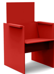
apple red: SC-LU-AR