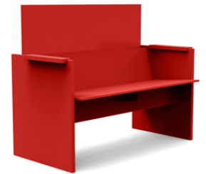
apple red: SC-LB-AR