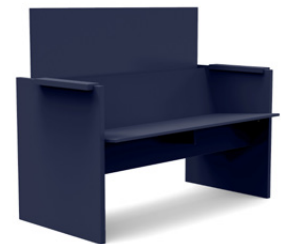
navy blue: SC-LB-NB