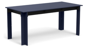
navy blue: SC-HT65-NB