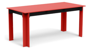
apple red: SC-HT65-AR