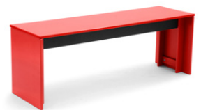
apple red: SC-HB48-AR