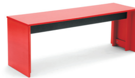
apple red: SC-HB48-AR