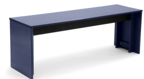
navy blue: SC-HB48-NB