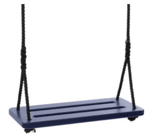
navy blue: AC-RS-NB