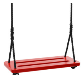
apple red: AC-RS-AR