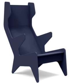
navy blue: RR-CC-NB