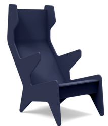
navy blue: RR-CC-NB