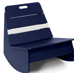
navy blue: RC-RR-NB