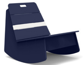
navy blue: RC-RR-NB