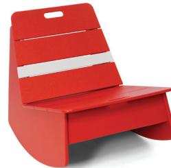
apple red: RC-RR-AR