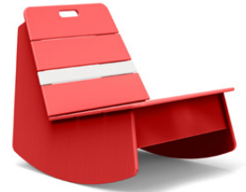
apple red: RC-RR-AR