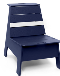
navy blue: RC-RLC-NB