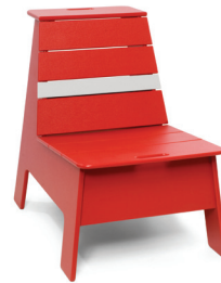
apple red: RC-RLC-AR