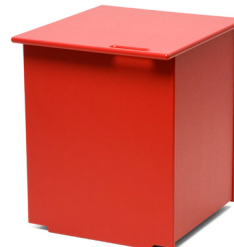
apple red: FC-MS14G-L-AR