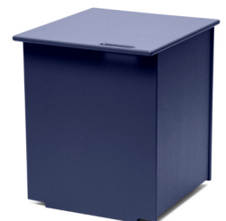
navy blue: FC-MS14G-L-NB

collection: planter material: 100% recycled HDPE dimensions: width: 14.75" (37.1cm) depth: 15.75" (39.7cm) height: 14" (35.6cm) weight: 21 lbs (9.6kg)