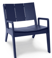
navy blue: NO-NO9C-NB