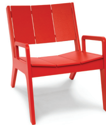
apple red: NO-NO9C-AR