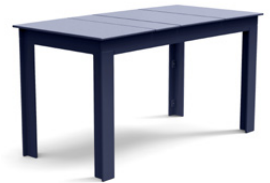
navy blue: LC-LPT-NB