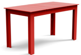
apple red: LC-LPT-AR