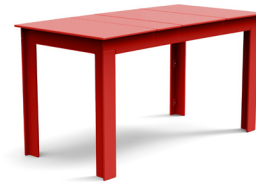
apple red: LC-LPT-AR