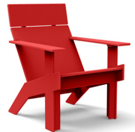
apple red: LC-LLT-AR