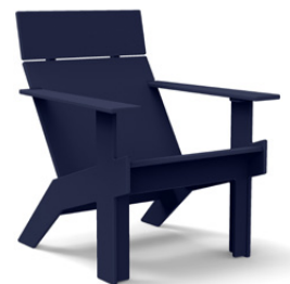
navy blue: LC-LLT-NB