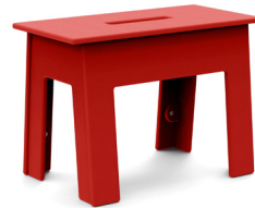
apple red: ST-HS-AR