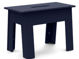
navy blue: ST-HS-NB