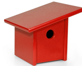
apple red: AC-PB-AR