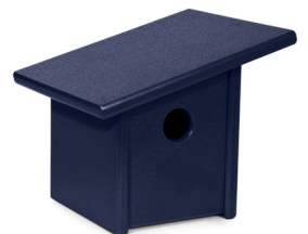
navy blue: AC-PB-NB