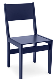
navy blue: AL-T81-NB

collection: alfresco material: 100% recycled HDPE dimensions: width: 17" (43.2cm) depth: 21.5" (54.6cm) height: 33.75" (85.7cm) weight: 19 lbs (8.6kg)