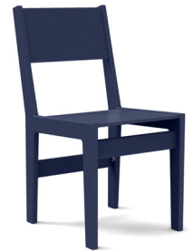
navy blue: AL-T81-NB