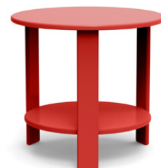
apple red: LC-ET-AR