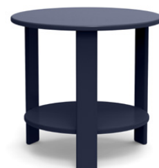
navy blue: LC-ET-NB