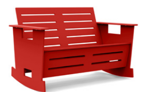
apple red: GO-LR-AR