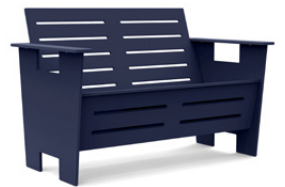
navy blue: GO-LS-NB

collection: go material: 100% recycled HDPE dimensions: width: 48.25" (122.6cm) depth: 26.75" (68.1cm) height: 32" (81.3cm) weight: 81 lbs (36.7kg)