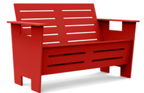
apple red: GO-LS-AR