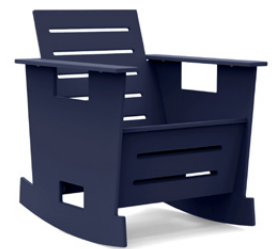
navy blue: GO-CR-NB