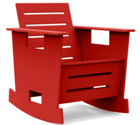
apple red: GO-CR-AR