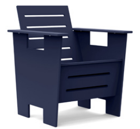
navy blue: GO-CC-NB