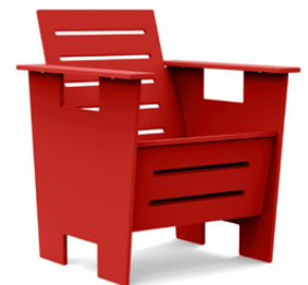
apple red: GO-CC-AR