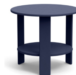
navy blue: LC-LST-NB