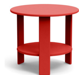
apple red: LC-LST-AR