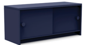
navy blue: SG-SC40-NB