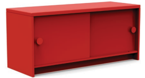
apple red: SG-SC40-AR