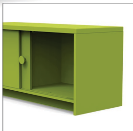
Dual sliding doors with center divide.