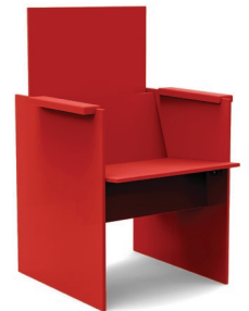
apple red: SC-LU-AR