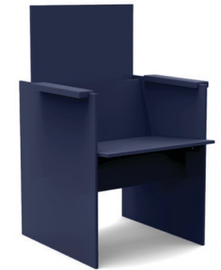
navy blue: SC-LU-NB