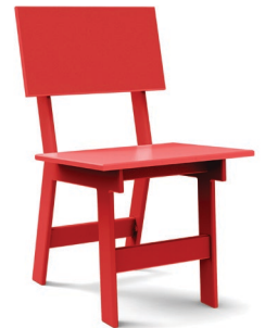
apple red: SC-EM-AR