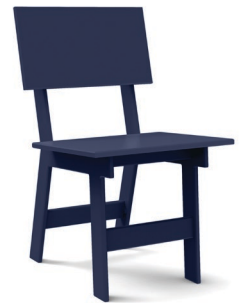
navy blue: SC-EM-NB