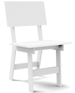
cloud: SC-E M-CW