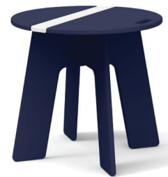
navy blue: RC-RSC-NB