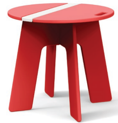
apple red: RC-RSC-AR