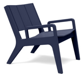
navy blue: NO-NO9C-NB