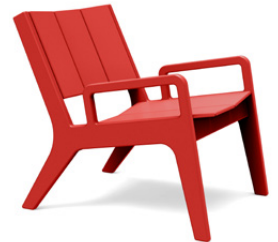
apple red: NO-NO9C-AR