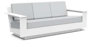
cloud: NC-S-(cushion code)-CW