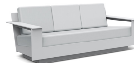
driftwood: NC-S-(cushion code)-DW