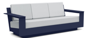
navy blue: NC-S-(cushion code)-NB