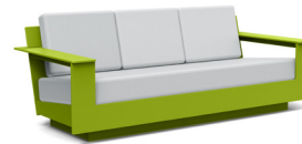
leaf: NC-S-(cushion code)-LG