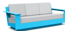
sky: NC-S-(cushion code)-SB