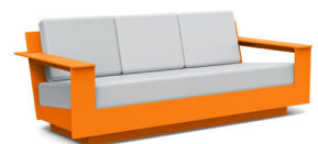
sunset: NC-S-(cushion code)-OR