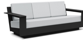
black: NC-S-(cushion code)-BL