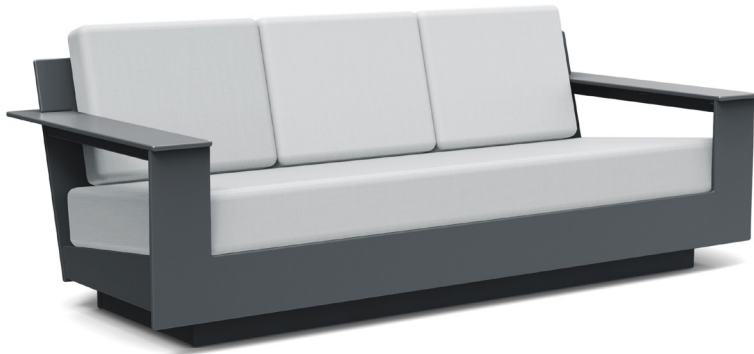
charcoal: NC-S-(cushion code)-CG