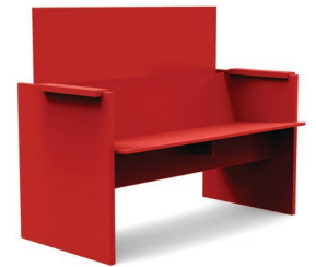
apple red: SC-LB-AR