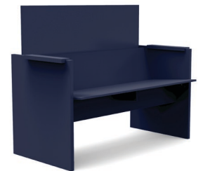
navy blue: SC-LB-NB