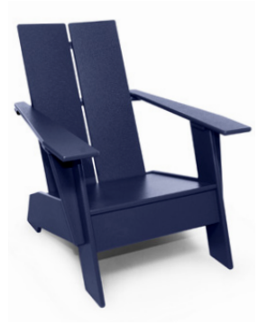
navy blue: KD-AD-NB