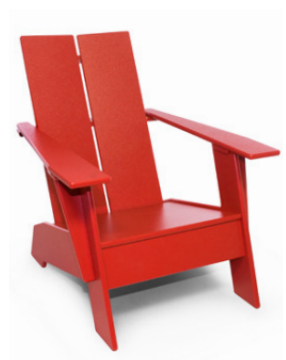
apple red: KD-AD-AR