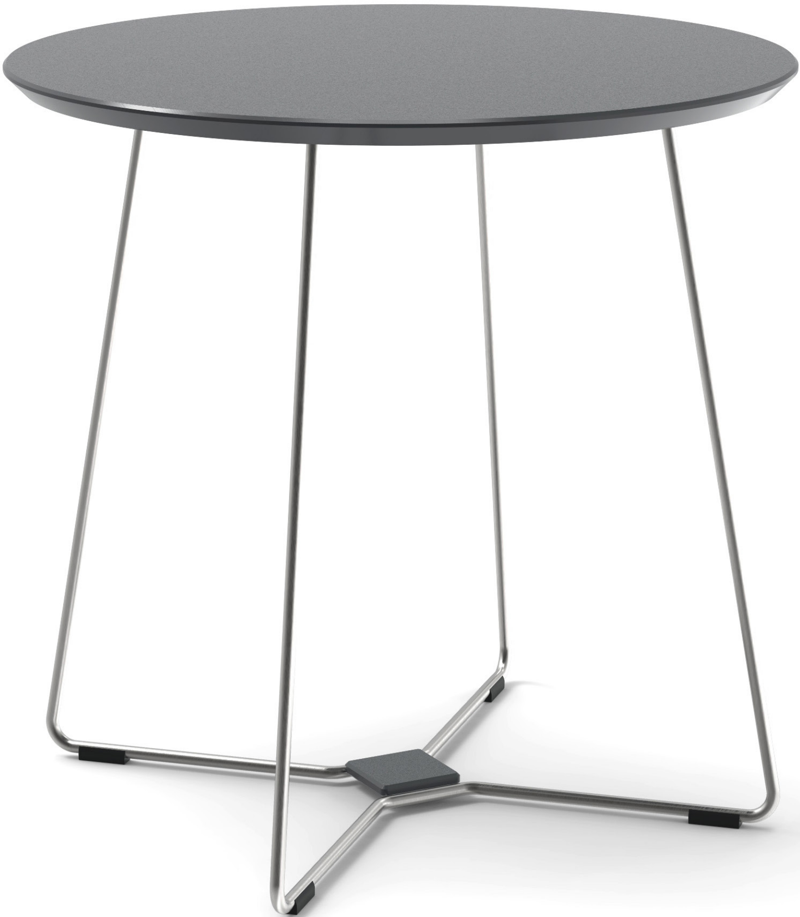
shown above: LL-KNE-DNTRD30-CG