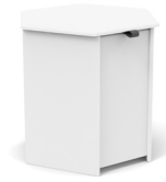
cloud: LL- SG-HNK181820-CW