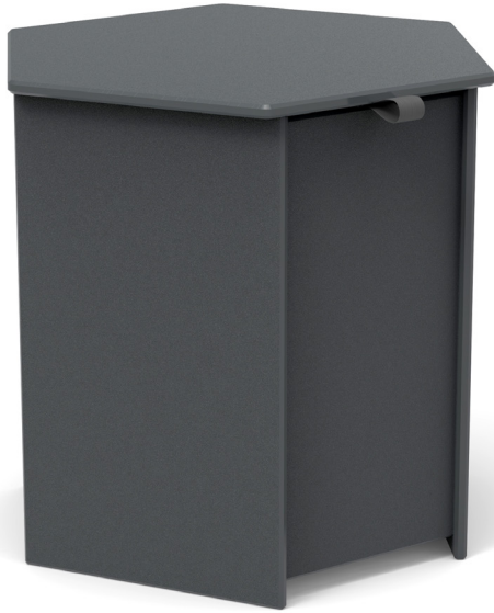
charcoal: LL- SG-HNK181820-CG