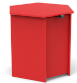
apple red: LL- SG-HNK181820-AR