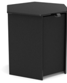
black: LL- SG-HNK181820-BL