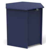
navy blue: LL- SG-HNK181820-NB