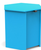
sky: LL- SG-HNK181820-SB

shipped flat packed some assembly required