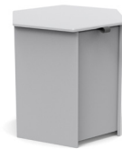
driftwood: LL- SG-HNK181820-DW