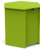
leaf: LL- SG-HNK181820-LG