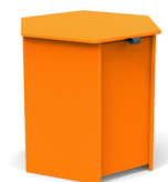
sunset: LL- SG-HNK181820-OR