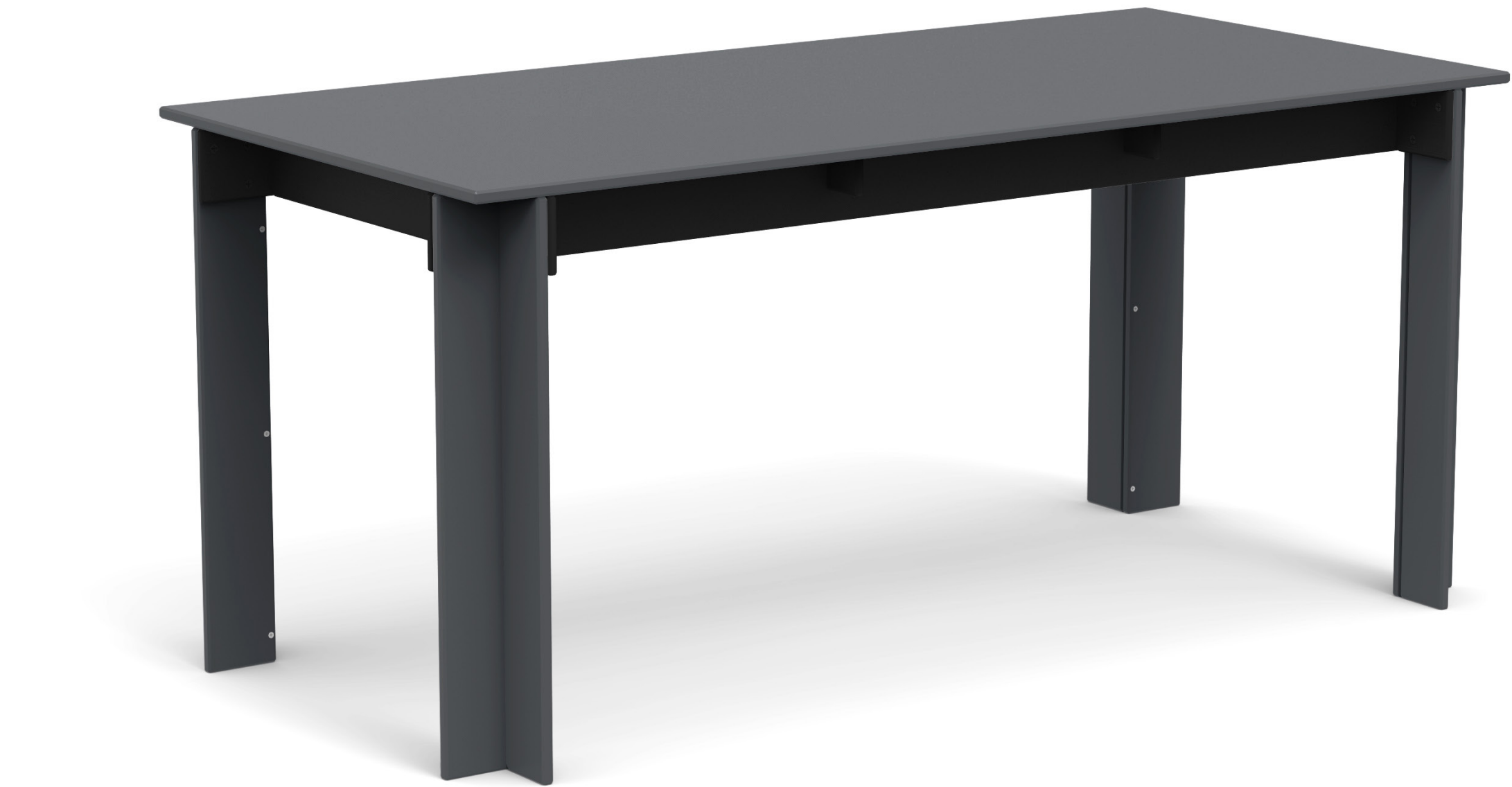
Shown above: LL-SC-HT65-CG

salmela emin chair salmela hall dining bench