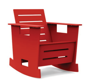
apple red: GO-CR-AR