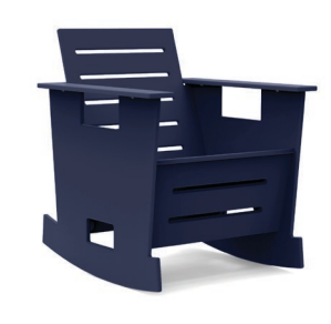
navy blue: GO-CR-NB