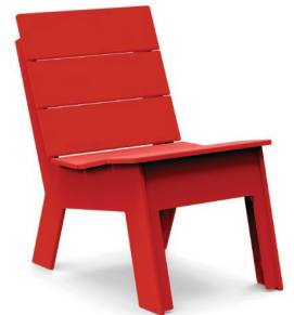
apple red: LG-FC-AR