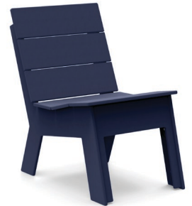
navy blue: LG-FC-NB