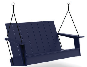
navy blue: AD-APS-NB