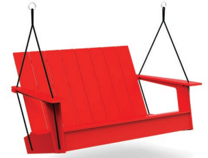
apple red: AD-APS-AR