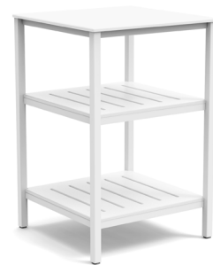
cloud white: ALC-SQOPPN2424-CW