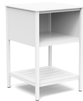
cloud white: ALC-SQCLD2424-CW