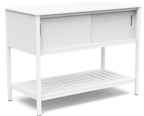
cloud white: ALC-CABHAF4824-CW