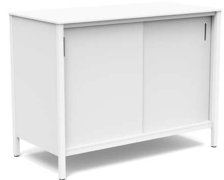
cloud white: ALC-CABFUL4824-CW