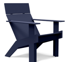
navy blue: LC-LLT-NB