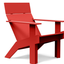
apple red: LC-LLT-AR