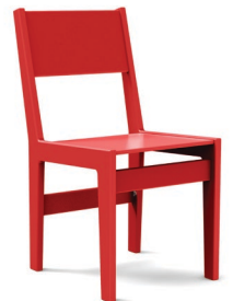
apple red: AL-T81-AR