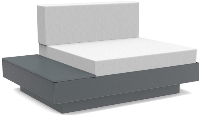
charcoal: LL-PO-LCH-1T-(cushion code)-CG