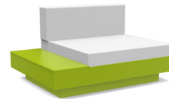
leaf: LL-PO-LCH-1T-(cushion code)-LG