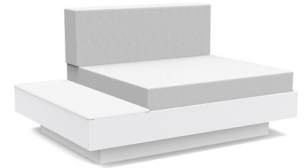
cloud: LL-PO-LCH-1T-(cushion code)-CW