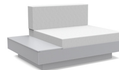
driftwood: LL-PO-LCH-1T-(cushion code)-DW