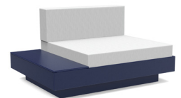
navy blue: LL-PO-LCH-1T-(cushion code)-NB