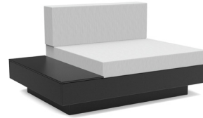
black: LL-PO-LCH-1T-(cushion code)-BL