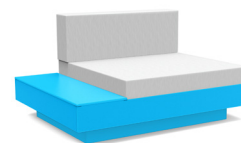
sky: LL-PO-LCH-1T-(cushion code)-SB