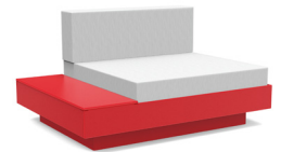
apple red: LL-PO-LCH-1T-(cushion code)-AR