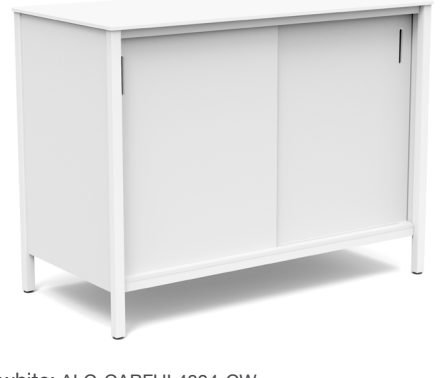
cloud white: ALC-CABFUL4824-CW